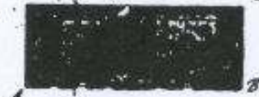
No. 11 Plan of the Cook house.