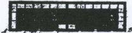
No. 10 Plan of Alderson Barracks